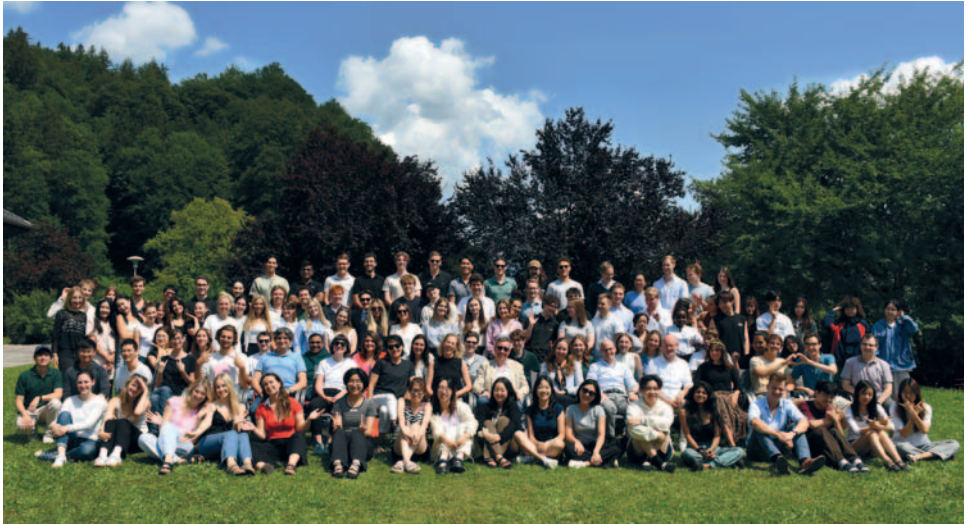
Summer school participants 2024