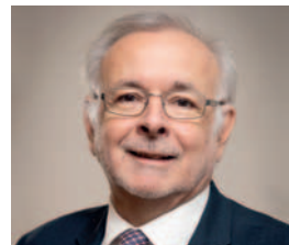
Oliver Rathkolb

Requirements: Participation in class room discussions (20%), oral presentation of a short paper on a topic of the course based on provided literature and supported research (3–4 pages) (40%), and writing an individual final essay on a broad general topic of the course written in class during the final exam (40%).